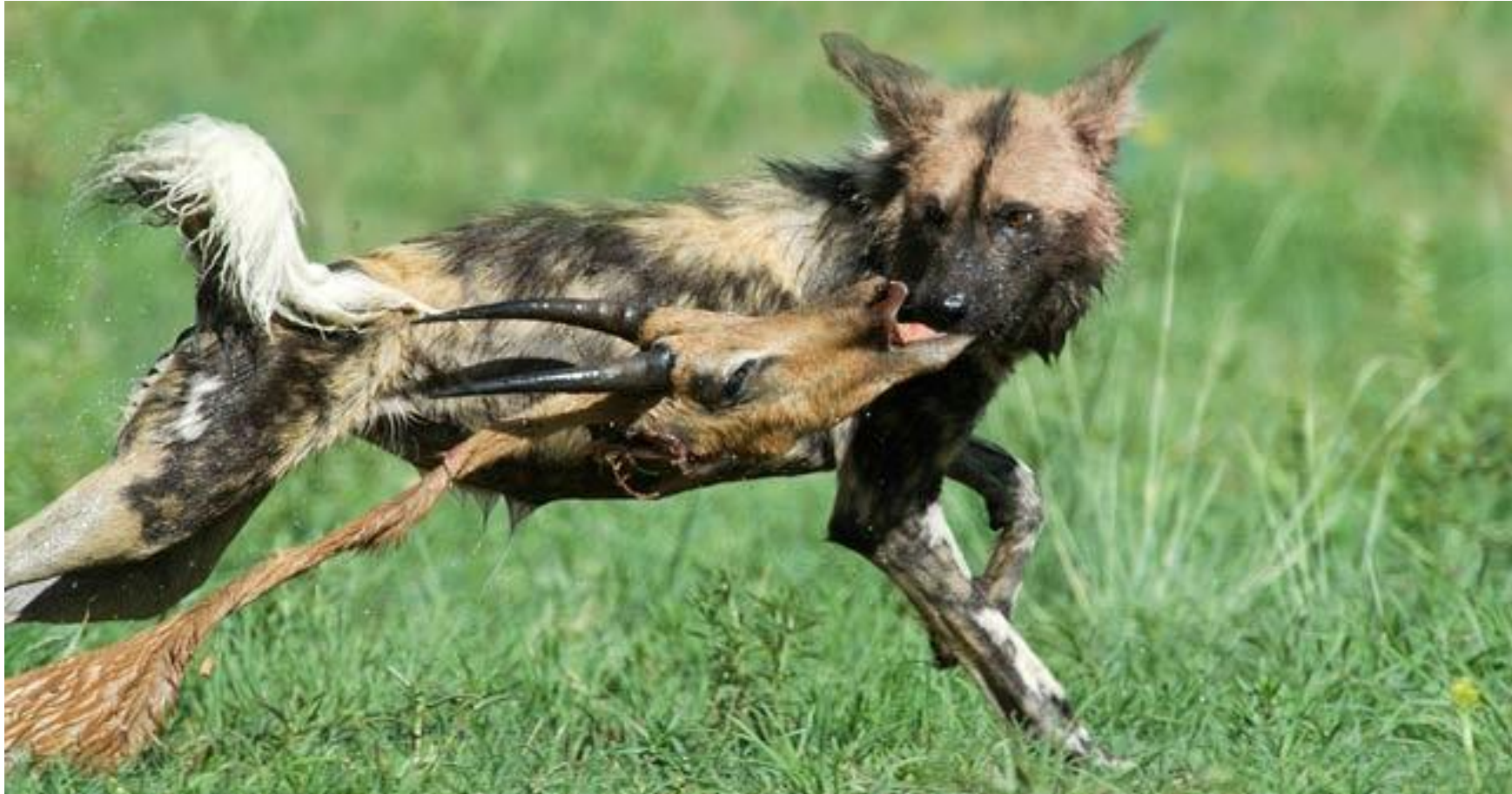
[ “Hunting dogs,” Planet Earth video series]