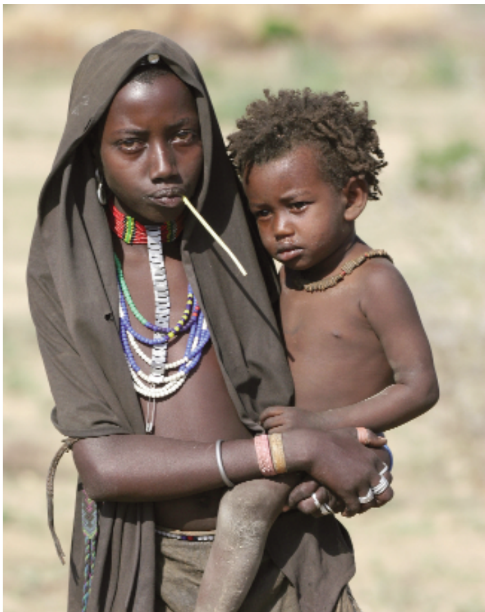
African Woman and Child.

On the other hand, breaking down the barriers that deny women access to health and family planning services, education, employment, land, and credit both increases women’s autonomy and encourages lower fertility rates. 2 Across continents, when women have more control over their lives, when they are less dependent on children and their role as a mother for support and security, they choose to have smaller families and to start them later. Throughout this